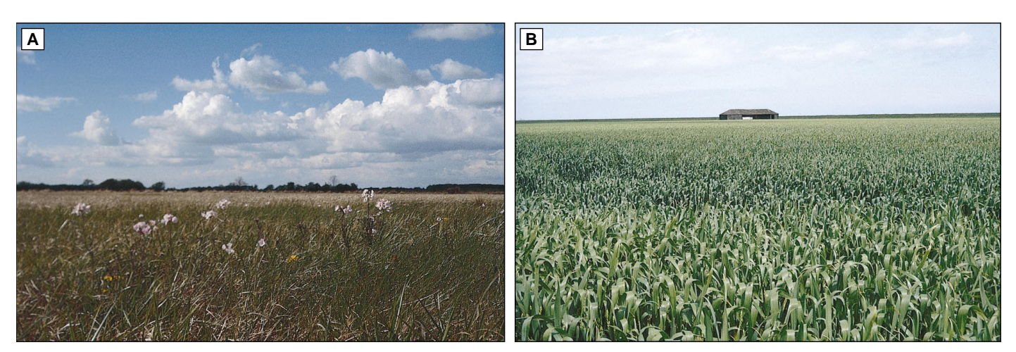
Fig. 2. Many human activities drastically simplify the species richness of ecosystems. (A) shows an ancient hay meadow on the Lower Derwent Ings in North Yorkshire, England. "Ing" is a Viking word meaning flooded meadow. The Ings flood every winter, remain damp in the summer, receive no fertilizer or pesticide inputs, and are cropped for hay and grazed in traditional land use practices that have their origins in Viking Britain. The resulting seminatural ecosystems are extremely rich in plants, insects, and birds. They are also very easily destroyed and drastically simplified (B) by draining, ploughing, the elimination of winter flooding, and conversion to arable agriculture. Similar changes in land use are severely altering the biological diversity of ecosystems all over the world.

Given the frequently strong effects of species composition and diversity on ecosystem processes seen in experimental studies, what can we expect in the future? Land use change currently has the largest effect on biodiversity (Fig. 2), but changes in atmospheric composition and climate will likely have increasing impacts. The current rapid rates of deforestation, urbanization, and overexploitation, whether through overgrazing or overfishing (61), strongly affect species composition and diversity. Areas in which there is substantial nitrogen deposition also exhibit reduced diversity (62).